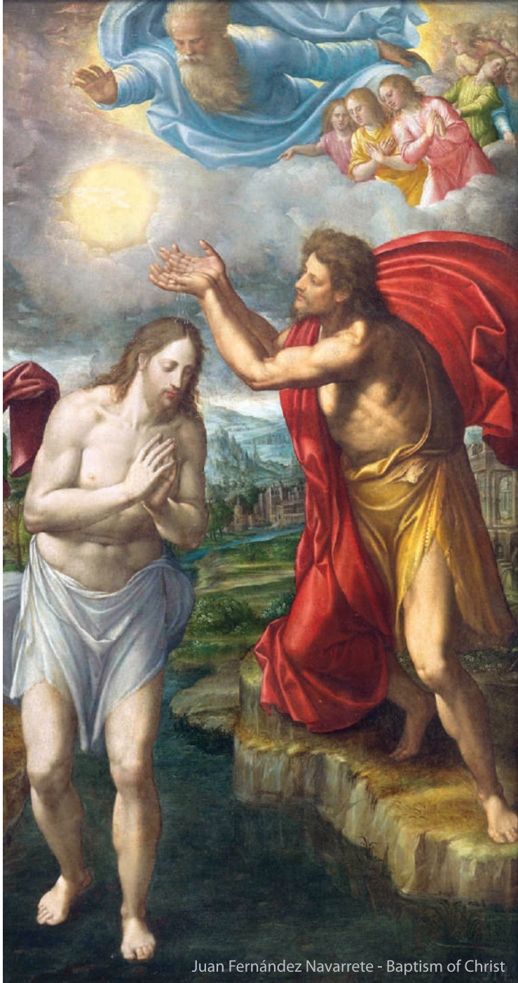
Juan Fernández Navarrete - Baptism of Christ

Our mission at St. Francis de Sales is to joyfully welcome you to our parish family of faith, trusting that: if you are seeking Christ, you will find Him here. If grieving, you will receive comfort. If troubled in spirit, you will receive the blessing of peace without being judged. If discouraged, you will rejoice in hope. If alone, you will find companionship and Christian love. May our parish be a sanctuary of peace for you as we journey together to the Father's house.