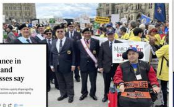
Members of St. Francis de Sales joined thousands of people at this year's March For Life

Published July 19, 2023 at 6:58 a.m. March 5, 2023 | 2,000 read